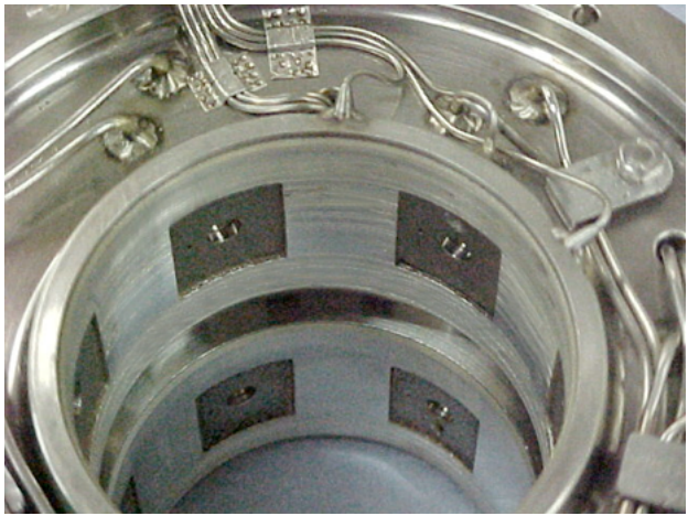
Fig. 2: Pictures.